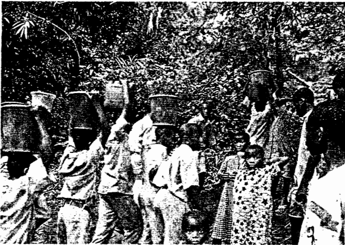
WATER FROM NEARBY SPRING