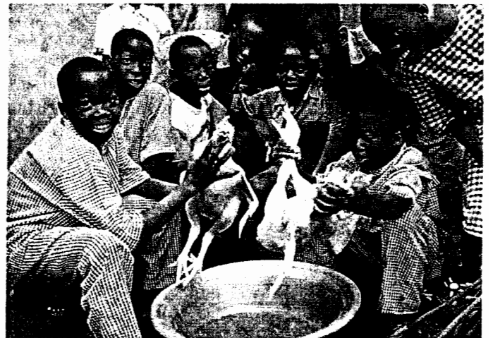
STUDENTS PREPARE LUNCH